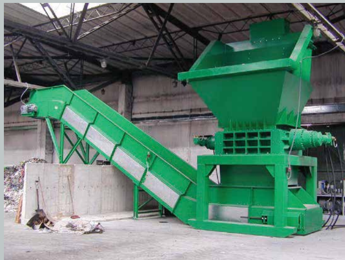
Shredder & Conveyor