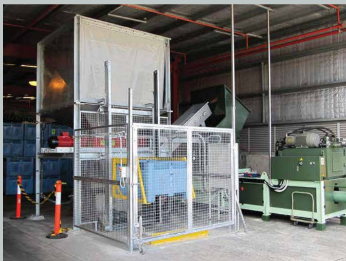
Water and cordial